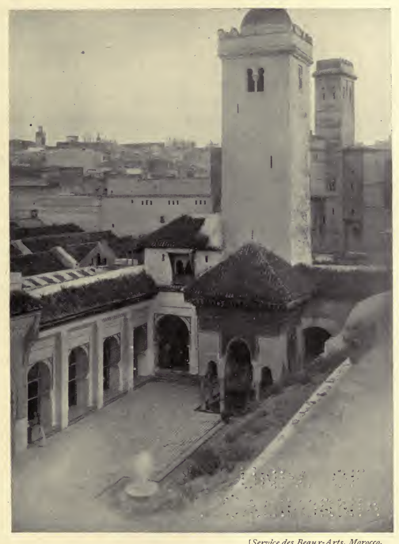
[Service des Beaux-Arts, Morocco.