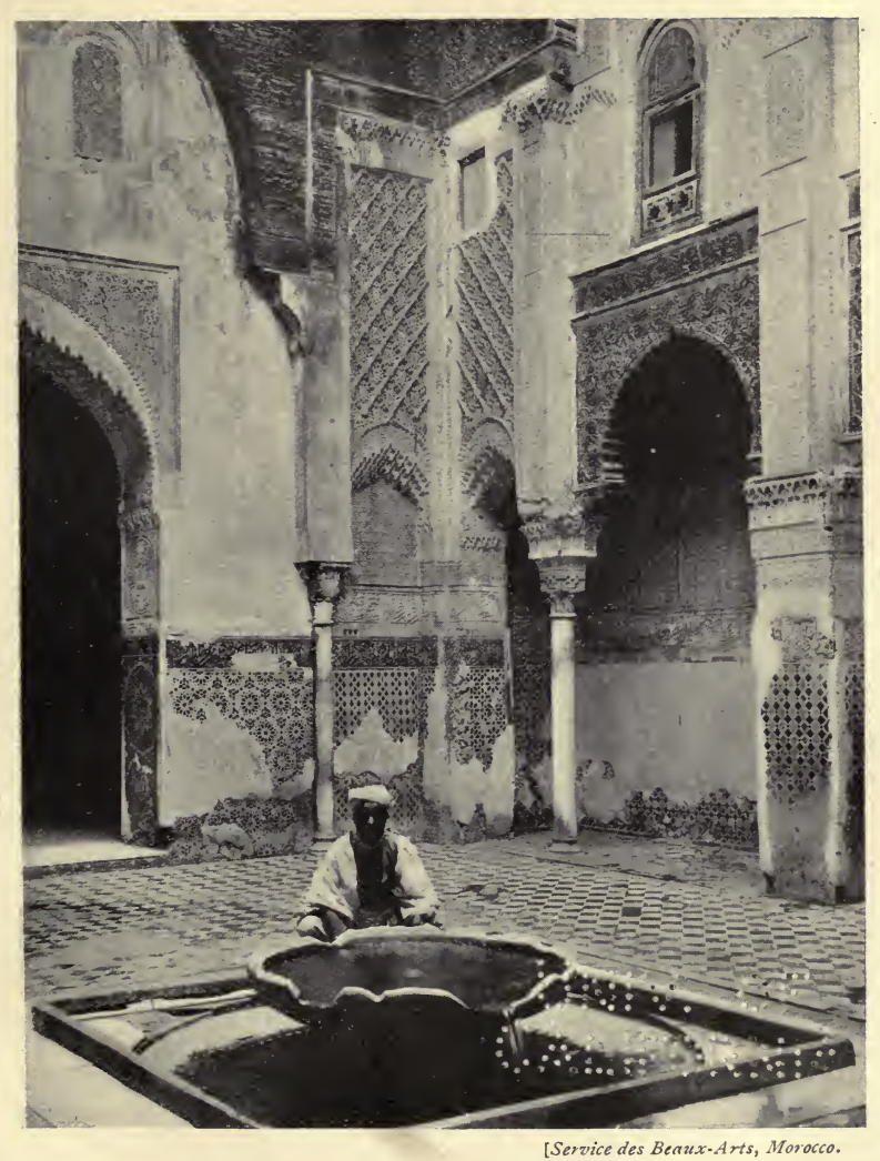
MEDERSA OF ATTARINE, FEZ.