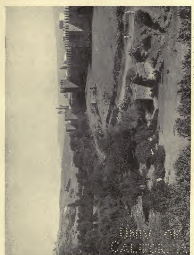
[Service des Beaux-Arts, Morocco.